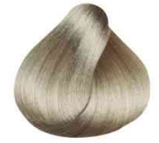
YPC784 9.2 RUBIO MUY CLARO MALVA LIGHT MAUVE BLONDE LOURO MUITO CLARO VIOLINE