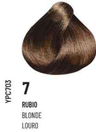
YPC703 7 RUBIO BLONDE LOURO