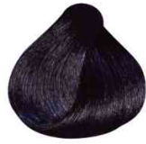
YPC712 3.16 CASTAÑO OSCURO CENIZA ROJIZO ASH RED DARK BROWN CASTANHO ESCURO ACINZENTADO VERMELHO