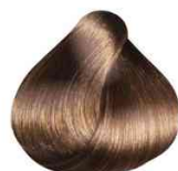
YPC730 8.31 RUBIO CLARO BEIGE DORADO GOLDEN BEIGE BROWN LOURO CLARO BEGE DOURADO