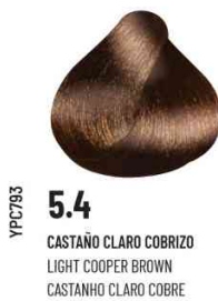
YPC783 5.4 CASTAÑO CLARO COBRIZO LIGHT COOPER BROWN CASTANHO CLARO COBRE