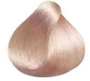
YPC785 10.2 RUBIO EXTRA CLARO MALVA VERY LIGHT MAUVE BLONDE LOURO CLARISSIMO VIOLINO