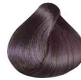
YPC790 8.21 RUBIO CLARO MALVA CENIZA ASH MAUVE BLONDE LOURO CLARO VIOLINE CINZA