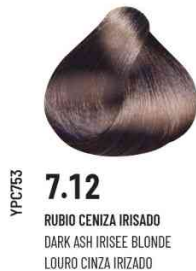
YPC753 7.12 RUBIO CENIZA IRISADO DARK ASH IRISEE BLONDE LOURO CINZA IRIZADO