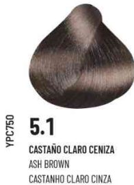
YPC750 5.1 CASTAÑO CLARO CENIZA ASH BROWN CASTANHO CLARO CINZA