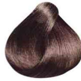
YOC782 7.2 RUBIO MALVA DARK MAUVE BLONDE LOURO VIOLINO