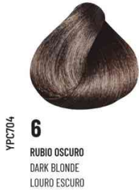
YPC704 6 RUBIO OSCURO DARK BLONDE LOURO ESCURO