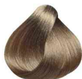
YPC728 8.13 RUBIO CLARO CENIZA DORADO GOLDEN ASH BLONDE LOURO CLARO CINZA DOURADO