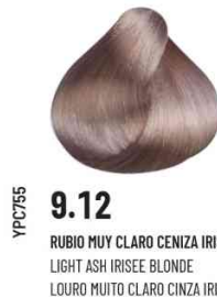
YPC755 9.12 RUBIO MUY CLARO CENIZA IRISADO LIGHT ASH IRISEE BLONDE LOURO MUITO CLARO CINZA IRIZADO