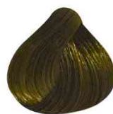
YPC797 VERDE GREEN VERDE