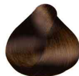
YPC724 7.73 RUBIO MARRON DORADO GOLDEN CHESTNUT DARK BLONDE LOURO MARRON DOURADO