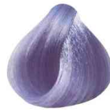
YPC800 LAVANDA METÁLICO METALIC LAVENDER LAVANDA METALICO