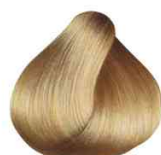
YPC735 9.3 RUBIO MUY CLARO DORADO GOLDEN LIGHT BLONDE LOURO MUITO CLARO DOURADO