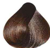
YPC721 7.14 RUBIO CENIZA COBRIZO COPPERY ASH DARK BLONDE LOURO ACINZENTADO ACOBREA