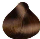
YPC725 8.73 RUBIO CLARO MARRON DORADO GOLDEN CHESTNUT BLONDE LOURO CLARO MARROM DOURADO