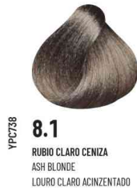
YPC738 8.1 RUBIO CLARO CENIZA ASH BLONDE LOURO CLARO ACINZENTADO