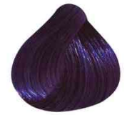
YPC796 VIOLETA VIOLET VIOLETA