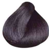
YPC788 6.21 RUBIO OSCURO MALVA CENIZA ASH MAUVE LIGHT BROWN LOURO ESCURO VIOLINE CINZA