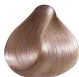
YPC748 902 RUBIO ULTRA CLARO NACARADO ULTRA LIGHTEST PEARL BLONDE LOURO ULTRA CLARO PERLADO