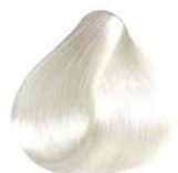
YPC804 000 ACLARANTE ESPECIAL SPECIAL LIGHTEST CLAREADOR ESPECIAL PROXIMAMENTE