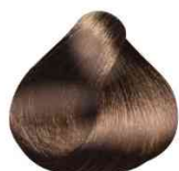
YPC726 6.13 RUBIO OSCURO CENIZA DORADO GOLDEN ASH LIGHT BROWN LOURO ESCURO ACINZENTADO DOURADO