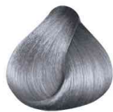
YPC798 GRIS METÁLICO METALIC GREY CINZA METALICO