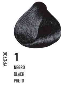
YPC708 1 NEGRO BLACK PRETO