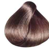
YPC783 8.2 RUBIO CLARO MALVA MAUVE BLONDE LOURO CLARO VIOLINO