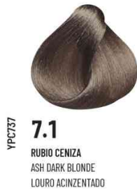
YPC737 7.1 RUBIO CENIZA ASH DARK BLONDE LOURO ACINZENTADO