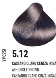
YPC751 5.12 CASTAÑO CLARO CENIZA IRISADO ASH IRISEE BROWN CASTANHO CLARO CINZA IRISADO