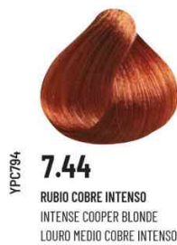
YPC784 7.44 RUBIO COBRE INTENSO INTENSE COOPER BLONDE LOURO MEDIO COBRE INTENSO