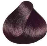
YPC714 5.20 CASTAÑO CLARO MALVA INTENSO VERY MAUVE BROWN CASTANHO CLARO VIOLINE INTENSO