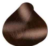
YPC716 5.74 CASTAÑO CLARO MARRON COBRIZO COPPERY CHESTNUT BROWN CASTANHO CLARO MARROM ACOBREADO