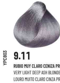
YPC803 9.11 RUBIO MUY CLARO CENIZA PROFUNDO VERY LIGHT DEEP ASH BLONDE LOURO MUITO CLARO CINZA PROFUNDO PROXIMAMENTE