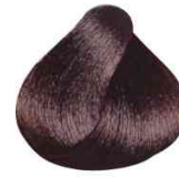
YPC781 5.5 CASTAÑO CLARO CAOBA LIGHT MAHOGANY BROWN CASTANHO CLARO ACAJU