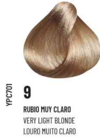
YPC701 9 RUBIO MUY CLARO VERY LIGHT BLONDE LOURO MUITO CLARO