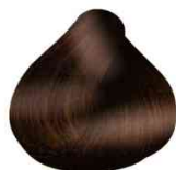
YOC723 6.73 RUBIO OSCURO MARRON DORADO GOLDEN CHESTNUT LIGHT BROWN LOURO ESCURO MARROM DOURADO