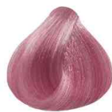
YPC799 ROSA METÁLICO METALIC PINK ROSA METALICO