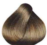
YPC732 6.3 RUBIO OSCURO DORADO GOLDEN LIGHT BROWN LOURO ESCURO DOURADO