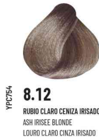
YPC754 8.12 RUBIO CLARO CENIZA IRISADO ASH IRISEE BLONDE LOURO CLARO CINZA IRISADO