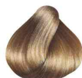
YPC734 8.3 RUBIO CLARO DORADO GOLDEN BLONDE LOURO CLARO DOURADO