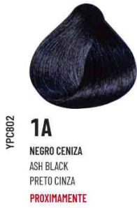
YPC802 1A NEGRO CENIZA ASH BLACK PRETO CINZA PROXIMAMENTE