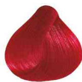
YPC746 ROJO RED VERMELHO