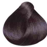
YPC789 7.21 RUBIO MALVA CENIZA ASH MAUVE DARK BLONDE LOURO VIOLINE CINZA