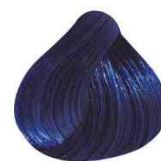
YPC745 AZUL BLUE AZUL