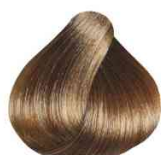
YPC733 7.3 RUBIO DORADO GOLDEN DARK BLONDE LOURO DOURADO