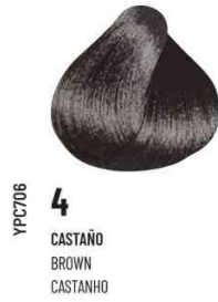
YPC706 4 CASTAÑO BROWN CASTANHO