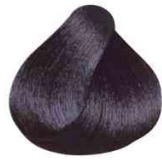
YPC787 5.21 CASTAÑO CLARO MALVA CENIZA ASH MAUVE BROWN CASTANHO CLARO VIOLINE CINZA