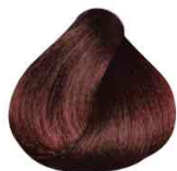
YPC710 6.60 RUBIO OSCURO ROJIZO INTENSO VERY LIGHT RED DARK BLONDE LOURO ESCURO VERMELHO INTENSO