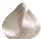
YPC748 901S RUBIO ULTRA CLARO CENIZA ULTRA LIGHTEST ASH BLONDE LOURO ULTRA CLARO CINZA