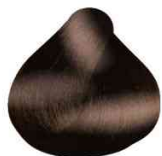
YPC719 5.73 CASTAÑO CLARO MARRON DORADO GOLDEN CHESTNUT BROWN CASTANHO CLARO MARROM DOURADO