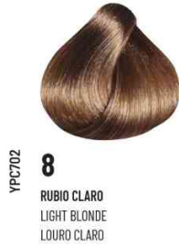
YPC702 8 RUBIO CLARO LIGHT BLONDE LOURO CLARO