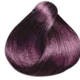
YPC786 7.20 RUBIO MALVA INTENSO INTENSE DARK MAUVE BLONDE LOURO VIOLINO INTENSO