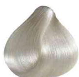
YPC747 900S RUBIO ULTRA CLARO NATURAL ULTRA LIGHTEST NATURAL BLONDE LOURO ULTRA CLARO NATURAL