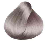
YPC715 9.21 RUBIO MUY CLARO MALVA CENIZA ASH MAUVE LIGHT BLONDE LOURO MUITO CLARO VIOLINE CINZA