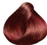
YPC805 7.62 RUBIO ROJIZO VIOLETA BLONDE RED VIOLET LOIRO VIOLETA AVERMELHADO PROXIMAMENTE