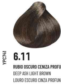
YPC741 6.11 RUBIO OSCURO CENIZA PROFUNDO DEEP ASH LIGHT BROWN LOURO ESCURO CINZA PROFUNDO