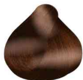
YPC718 7.74 RUBIO MARRON COBRIZO COPPERY CHESTNUT DARK BLONDE LOURO MARROM ACOBREADO