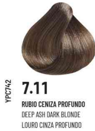
YPC742 7.11 RUBIO CENIZA PROFUNDO DEEP ASH DARK BLONDE LOURO CINZA PROFUNDO