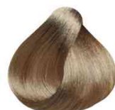
YPC729 9.13 RUBIO MUY CLARO CENIZA DORADO GOLDEN ASH LIGHT BLONDE LOURO MUITO CLARO CINZA DOURADO