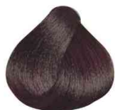
YPC722 5.23 CASTAÑO CLARO MALVA DORADO GOLDEN MAUVE BROWN CASTANHO CLARO ACAJU DOURADO