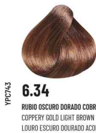
YPC743 6.34 RUBIO OSCURO DORADO COBRIZO COPPERY GOLD LIGHT BROWN LOURO ESCURO DOURADO ACOBREADO