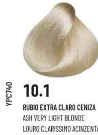
YPC740 10.1 RUBIO EXTRA CLARO CENIZA ASH VERY LIGHT BLONDE LOURO CLARISSIMO ACINZENTADO