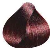
YPC711 6.66 RUBIO OSCURO ROJIZO PROFUNDO DEEP RED DARK BLONDE LOURO ESCURO VERMELHO PROFUNDO