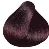
YPC713 4.51 CASTAÑO CAOBA CENIZA MAHOGANY ASH DARK BROWN CASTANHO ACAJU CINZA