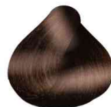
YPC720 6.7 RUBIO OSCURO MARRON CHESTNUT LIGHT BROWN LOURO ESCURO MARROM