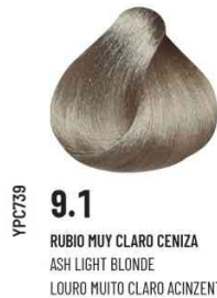
YPC739 9.1 RUBIO MUY CLARO CENIZA ASH LIGHT BLONDE LOURO MUITO CLARO ACINZENTADO