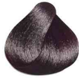
YPC780 5.2 CASTAÑO CLARO MALVA MAUVE BROWN CASTANHO CLARO VIOLINO