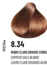
YPC744 8.34 RUBIO CLARO DORADO COBRIZO COPPERY GOLG BLONDE LOURO CLARO DOURADO ACOBREADO