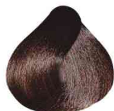
YPC717 6.41 RUBIO OSCURO COBRE CENIZA COPPERY ASH LIGHT BROWN LOURO ESCURO ACOBREADO ACINZENTADO