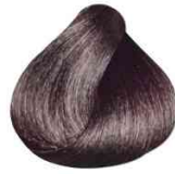
YPC781 6.2 RUBIO OSCURO MALVA LIGHT MAUVE BROWN LOURO ESCURO VIOLINO