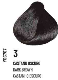
YPC707 3 CASTAÑO OSCURO DARK BROWN CASTANHO ESCURO