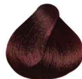
YPC709 5.60 CASTAÑO CLARO ROJIZO INTENSO VERY LIGHT RED BROWN CASTANHO CLARO VERMELHO INTENSO