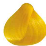
YPC795 AMARILLO YELLOW AMARELO