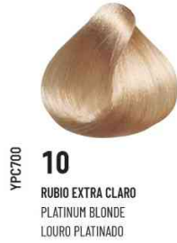
YPC700 10 RUBIO EXTRA CLARO PLATINUM BLONDE LOURO PLATINADO