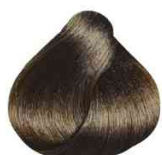
YPC731 5.3 CASTAÑO CLARO DORADO GOLDEN BROWN CASTANHO CLARO DOURADO