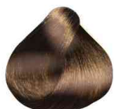
YPC727 7.13 RUBIO CENIZA DORADO GOLDEN ASH DARK BLONDE LOURO ACINZENTADO DOURADO