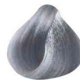
YPC801 AZULINO METÁLICO METALIC BLUE AZUL METALICO