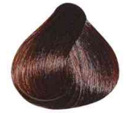
YPC792 6.5 RUBIO OSCURO CAOBA DARK MAHOGANY BLONDE LOURO ESCURO ACAJU