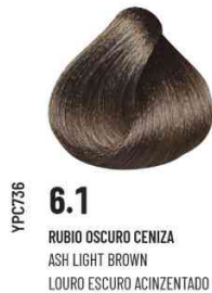
YPC736 6.1 RUBIO OSCURO CENIZA ASH LIGHT BROWN LOURO ESCURO ACINZENTADO