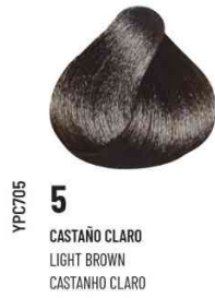
YPC705 5 CASTAÑO CLARO LIGHT BROWN CASTANHO CLARO