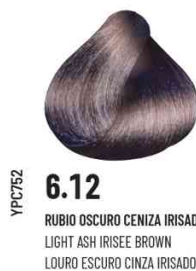
YPC752 6.12 RUBIO OSCURO CENIZA IRISADO LIGHT ASH IRISEE BROWN LOURO ESCURO CINZA IRISADO